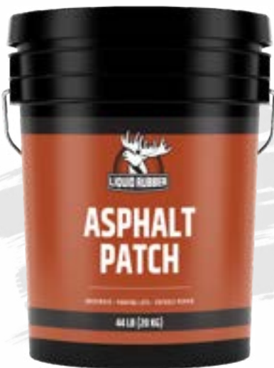
44LB (20KG) 4 gallon pail