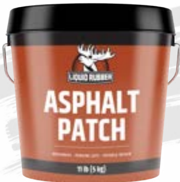
11lb (5kg) 1 gallon pail