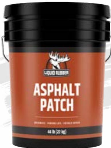
44lb (22kg) 5 gallon pail