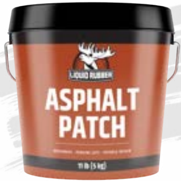
11lb (5kg) 1 gallon pail