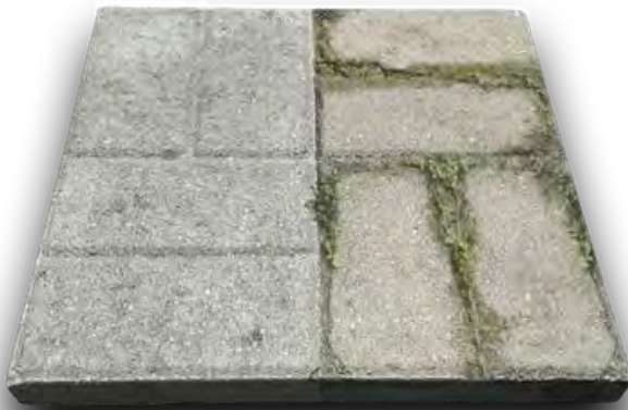
Sealed vs unsealed